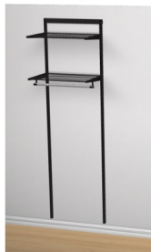
3/4 hanging (with a shelf above or below)